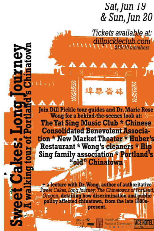
POSTER DESIGN BY LYNN YARNE